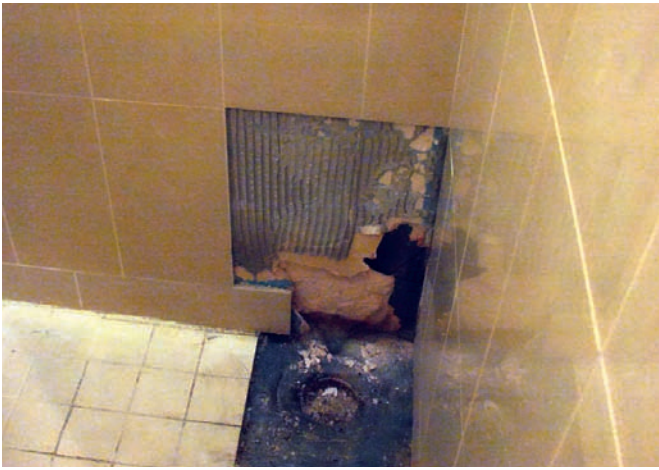
This glass mat water-resistant gypsum backer board was installed over the shower pan liner into the mortar shower base. The panel's acrylic coating provides waterproofing properties. However, the instructions are very specific that it is to be placed above the mortar and sealed with a sealant. This shower failed after 8 months of use because the instructions were not followed.

the instructions and know the limitations of the product. The old adage of if it sounds too good to be true it remains alive and well. Many people gravitate towards liquid waterproofing products for their unmistakable ease of use. While that is undoubtedly true, liquids are some of the most widely abused waterproofing products. There are vast differences among products in both performance levels and application. Something that costs $150 a pail is not the same as something that cost $300 and just a different color despite the insistence of what is often a less-than-educated salesperson wanting to make a sale. Setting materials are very competitively priced. On the face of things, it is hard to say what is different about one product that is half the cost of another but rest assured, there is a difference. It may be the drying time, the application thickness requirement, the degree of waterproofing provided, or whether a reinforcing scrim is required among other possibilities.