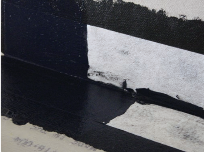
When fabric application is required, it is required that all corners must be pretreated. Smaller strips of fabric are applied to and then coated with a generous application of the waterproofing product.

flood testing. In this case, over a new mortar bed, that means the membrane needs to cure per manufacturers recommendations, a minimum of 24 hours at 70 and 50% RH for Product A (rather than the 12 hours for application over a cured slab) , 48 hours over new mortar for Product B, and 72 hours for Product C. If the temperature is any colder, or the humidity any higher, additional time will be required. The second reason flood testing is often omitted is it means even more time after one to three days of no activity in the shower while waiting for a product to cure. As can be expected, everyone is anxious to get the job completed and get the rooms rented once again.