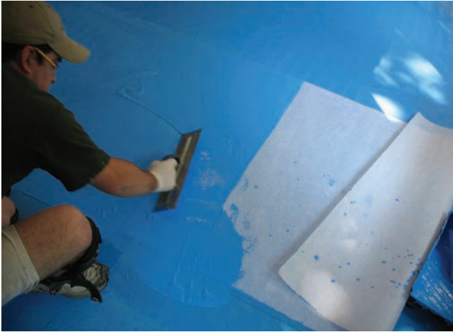
Some products lend themselves well to trowel application. The advantage of troweling is that the product is firmly engaged in the substrate and unlike rolling, the notches assure that adequate product is applied during each of the required layers.

determined. Both the owners schedule and the contractors bid assume 276 showers at 3 ½ days per shower or 966 man days for the contractor. Based on his estimate and rounding up to full days, that is 1,104 days of lost use for the owner. Can it be done? We will take a look at the variation in requirements for each product and how the contractor’s selection will affect the schedule of manning the job for the contractor and the loss of income for the owner.